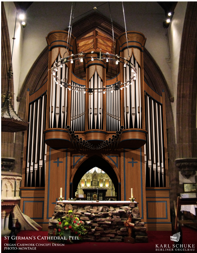
ST GERMAN'S CATHEDRAL, PEEL

The task is a great one as the new instrument has to support the developing Choral Programme, it has to play a major and impressive part in Diocesan and National Island services, as well as provide an exciting opportunity as a concert and more importantly teaching instrument. It is the very centre-piece of the Cathedral Music Programme, and an impressive piece of art for our beautiful Cathedral.