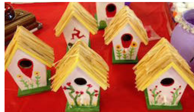
Handmade Manx "cottage" bird feeder