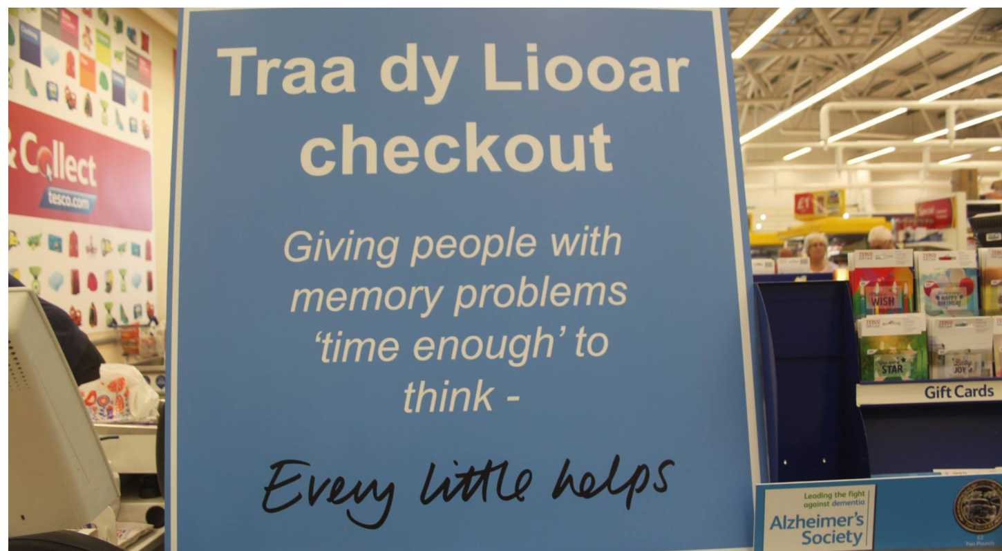
Tesco Supermarket putting our most useful expression to work for the good of the community!