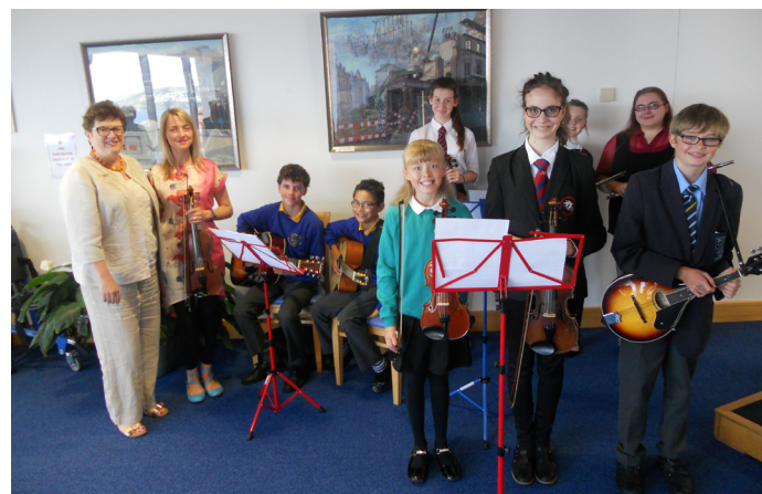
Add names of winners.