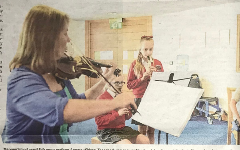
Marown School year 6 folk group perform 'Arrans y Chasht'. The school won an award for its outstanding contribution to Manx culture by a group of young people aged under 25.

The annual awards ceremony which recognises those who have excelled in the fields of Manx music, culture, the arts and crafts, and involvement with the island's community was held on Friday at Legislative Buildings in Douglas.