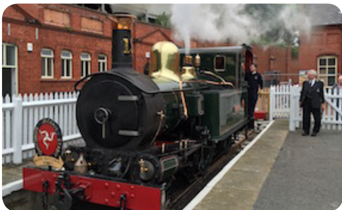
Isle of Man Steam Railways, Douglas. Engine No.13 "Kissack"

If you have news you'd like to share with the members of the North American Manx Association, please email kelly@mustgoto.com