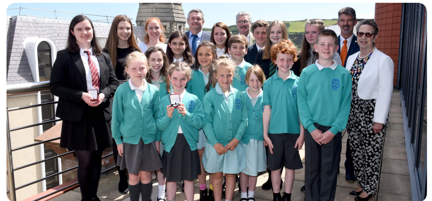
The winners are gathered outside the Barool Suite. Well done to all of them!