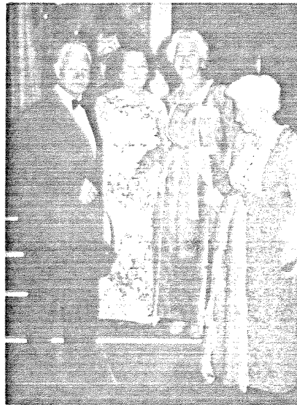
Delegates attending the Convention. (6223)