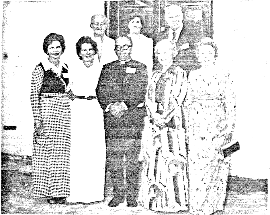
NEW EXECUTIVE OF NAMA.