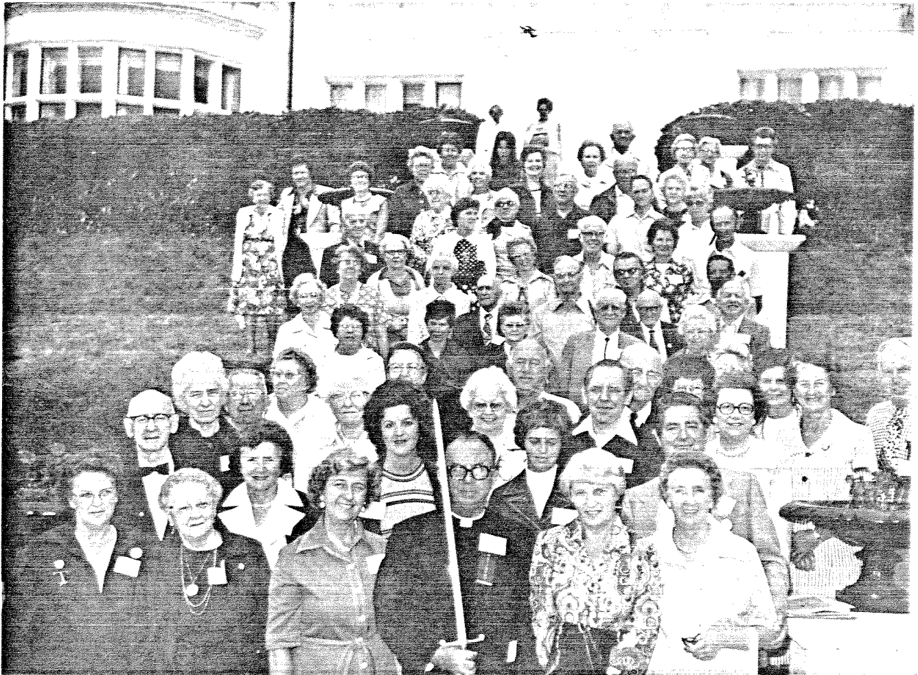
Delegates attending the 1976 North American Manx Association Convention Douglas, Isle of Man. July 11, 12, 13, 14, 1976. (5936)