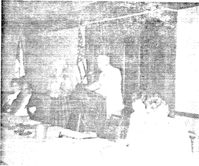
Opening ceremonies at the Sheraton Hotel, Rocky River, Ohio.