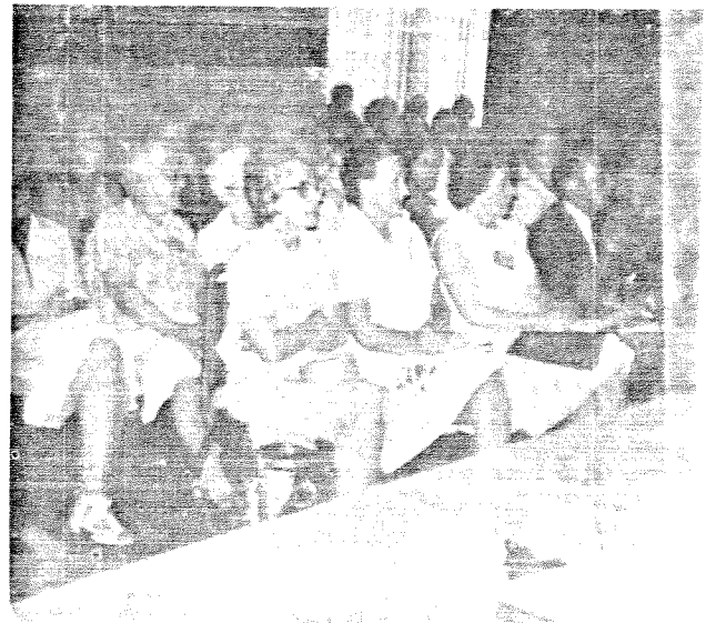
Business Meeting - Delegates.