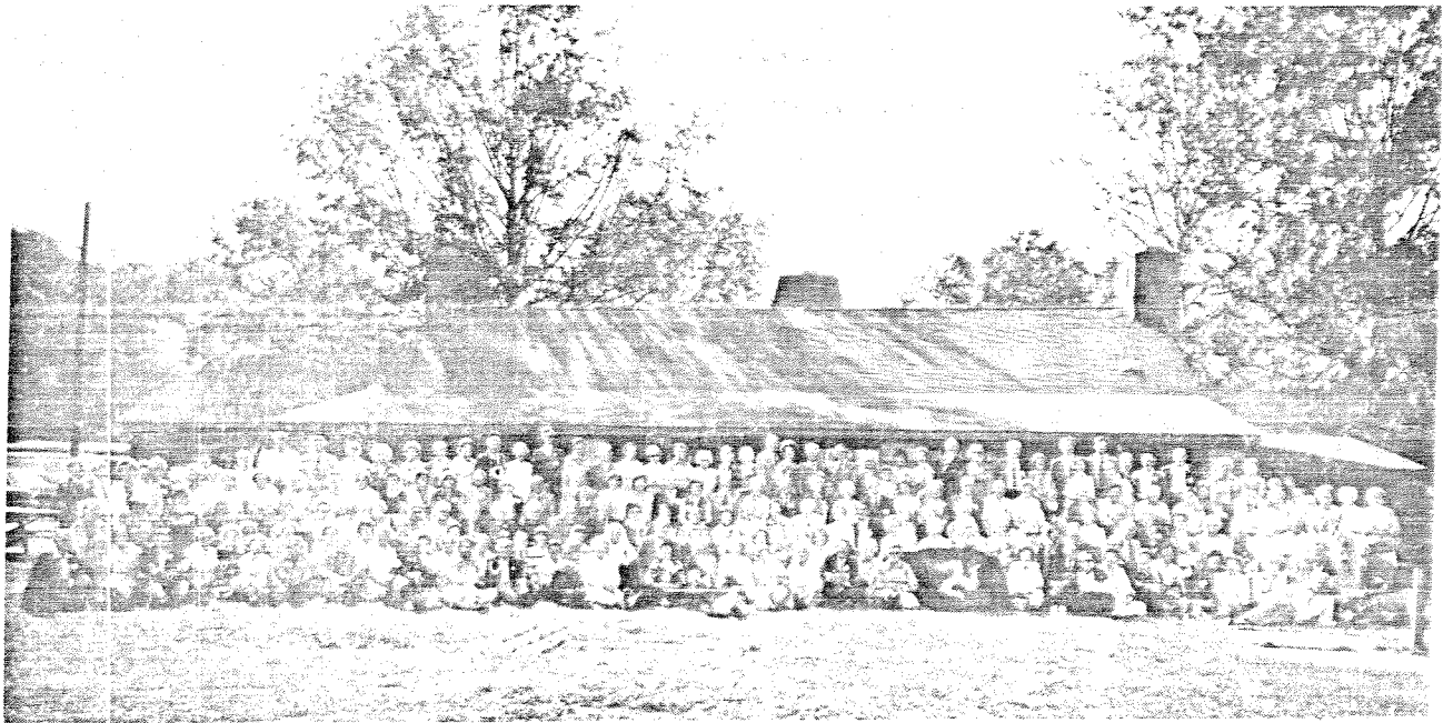
Delegates at Clague Park, Westlake