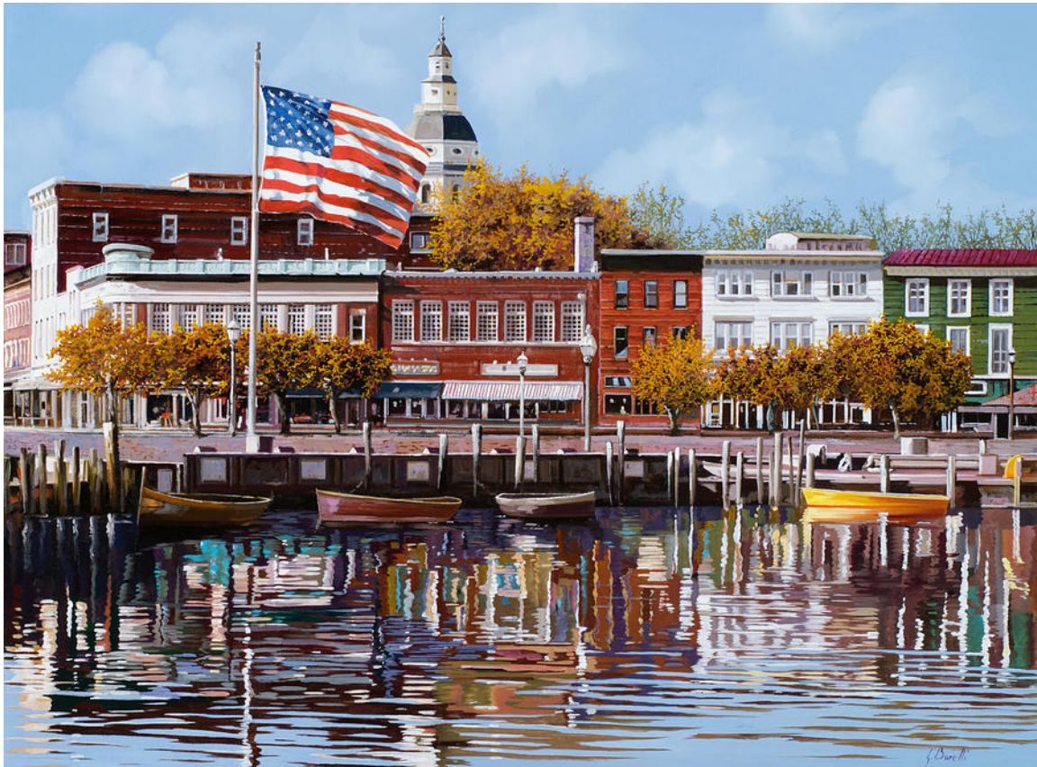
ANNAPOLIS, MARYLAND. HOST TOWN FOR THE 2016 NORTH AMERICAN MANX ASSOCIATION CONVENTION.