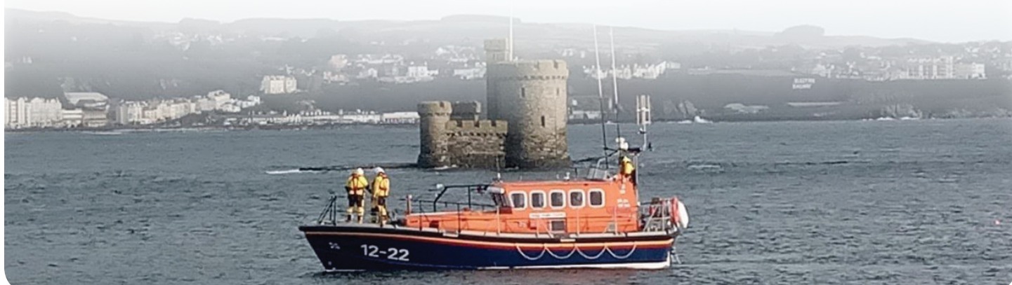
As the Royal National Lifeboat Institution (RNLI) prepares to mark its 200th birthday, we celebrate the fact it was founded in Douglas by Sir William Hillary in 1824.

Regarding these bookings, please state you are part of the North American Manx Association and are requesting a room/rooms from the group allocation. The hotel will request your details and debit/credit card information to guarantee the booking.